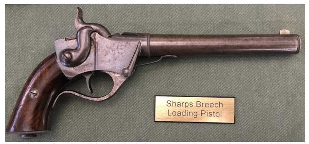
Extremely rare Sharps breech loading pistol with automatic primer from the Mark Anniballi display.

The word "rare" has been abused when describing collectable arms, but some of the guns on the tables were truly rare. For example, three guns on one table may be "one-of-a-kind" experimental, trials or prototype guns. They included a Sharps conversion from a muzzleloader to breechloader (with 1856 patent drawings and documentation), a Remington Rolling Block Transformed Rifle (by Remington with documents) of unusual configuration with brass mountings, and one converted breechloader of unknown provenance.