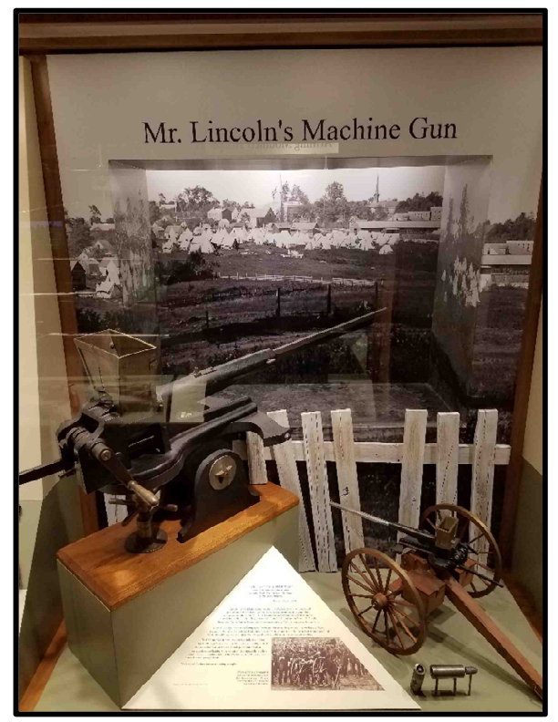
Below the Rotunda is the part of the museum that will probably appeal most to the members of

The Rotunda ( at right in the picture at the beginning of this article ) is designed to suggest a stylized drum with buttresses resembling rifle stocks. Inside, it contains chronologically arranged exhibits highlighting the Civil War battles and events that took place on Virginia soil – and only those that took place in Virginia. Do not look for exhibits on the battles of Gettysburg or Vicksburg – you won't find them!