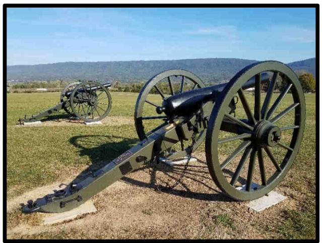
Scenes from the New Market Battlefield, to include the Bushong Farm House (left) around which the VMI cadets attacked and two cannons on the Union line donated by the author Jeff Shaara on the 140th Anniversary of the battle (right).

The museum is open daily year-round 9:00 a.m. to 5:00 p.m., except New Year's Day, Thanksgiving Day, Christmas Eve, and Christmas day. Adult admission is $10 each, with discounts for seniors, kids, and military (active and retired) and their families. VMI cadets, their parents and alumni, as well as children under 5 years old, are free.