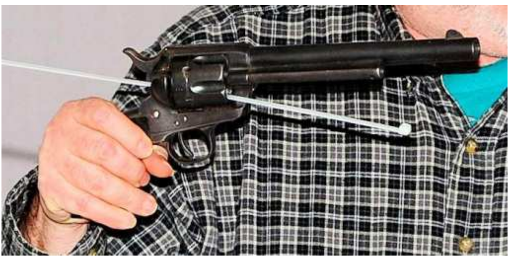
Bottom: 1873 Colt Single Action Army that is officially documented as being sold to the U.S. Army in 1890.