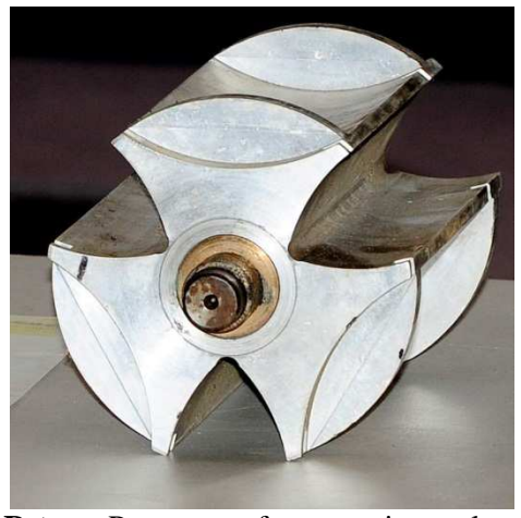
R-top: Prototype of an experimental 25mm Naval gun that was never developed shows the unique Dardick cylinder design features.

L-top: AK-47 themed oriental carpets or mats called "war rugs," made by Baluchi craftsman of the Baluchistan region during Russian occupation of Afghanistan. They will often feature AK-47s, but also other items like grenades, RPG's, Soviet Mi-24 Hind helicopter gunships, ammo or Katushkya rockets.