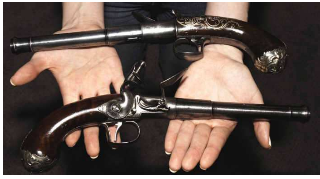
Left: Note the unique frizzen spring, gorgon butt cap and sterling silver wire inlays.