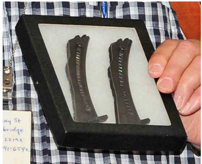
Special "banana" magazines for .22 Short Olympic event