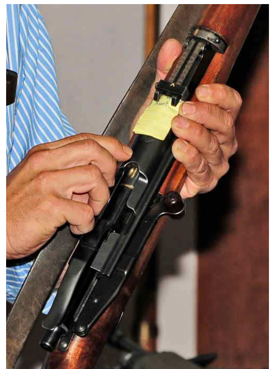
Right: The Hammerli airgun "trainer" replaces the bolt in a Swiss K31 rifle. It shoots 4.5mm lead balls.