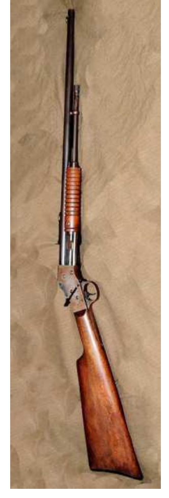
Shooting the Henry "Golden Boy" Rifle, Serial # VGCA001x