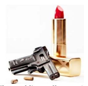
The world's smallest semi-auto pistol.