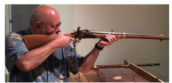
The author in the Army Museum handling a Swedish rifle-musket.

For arms collectors, the museum's galleries house the most comprehensive collection of Swedish weapons in existence. The collection details the technological development of Swedish military firearms from the 16<sup>th</sup> century (matchlocks, wheel locks, snaphaunces and flintlocks) to the modern arms of today's Swedish army, including the AK-5 Assault Rifle version of the FN FNC. It also includes a number of unique weapons, including developer's models and prototypes, whether they went into production or not. Among these are the world's smallest automatic pistol. Many of the weapons on display can be handled by visitors. The Army Museum is open year-round and admission is free.