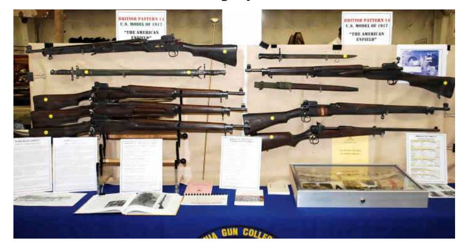
First Place: Marc Gorelick's display of "The American Enfield - US Rifle Model of 1917 and British Pattern 14"