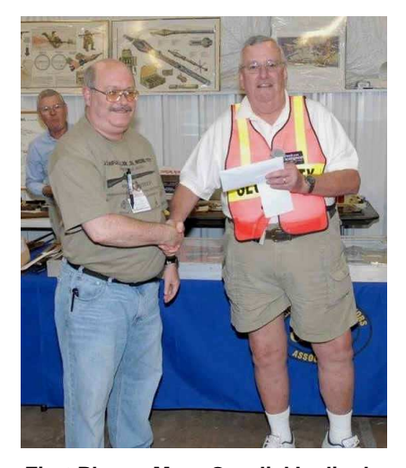
Fall 2007 Show Awards and Displays