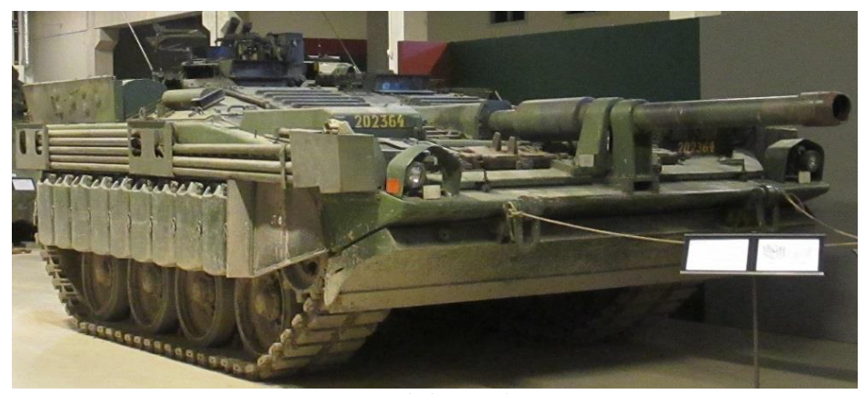
Swedish S Tank

tactical development in armored fighting vehicles took place. The museum's collection includes about 350 vehicles, of which about 75 are on public display at any time. These range from the earliest British and French armored fighting vehicles (AFVs) purchased by Sweden to the famous Swedish S Tank to the very latest Swedish version of the German Leopard 2 MBT, the Stridsvagn 122 or Leopard 2S, which is on active service with the Swedish Army today. Although the majority of the vehicles are those that were in Swedish service, the collection and displays also include many well-known, and some rare, foreign AFVs, including a German Jagdpanzer 38 Hetzer and Panzer I, Russian T34-85, T55 and T-72 tanks, British Centurions (adopted by Sweden) and a Chieftain Mk10 tank, and an American M4A4 Sherman armed by the British with their 76mm (17 pdr.) Quick Firing Gun, and called the "Firefly" during World War II. American AFVs in the collection include an M24 Chaffee Light Tank and an M8 Greyhound armored car used by the Swedish UN Battalion in the Congo.