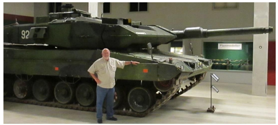
The author next to a Swedish Leopard 2S Main Battle Tank in the Arsenalen.