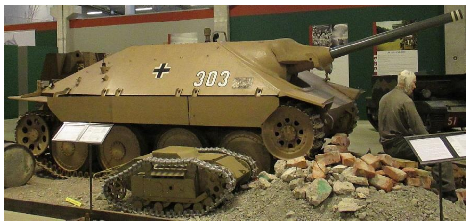
German Jagdpanzer 38 Hetzer and SdKfz. 302 Goliath

While the displays in the building are static, most are accessible and many of the vehicles can be touched. They are not packed together so the visitor can see them from almost every angle. Most of the vehicles belong to the Swedish government, some are one of a kinds, and many are in operational condition and are driven a few times a year. The Arsenalen Museum also houses the museum of the local Södermanland Regiment which existed from the 14<sup>th</sup> century to 2005 and took part in many of Sweden's wars. Arsenalen also houses a fascinating museum of miniature figures, formerly a private collection, which shows the military history of the world in a number of dioramas. The museum grounds also contain an original soldier's croft or farm from the late 19<sup>th</sup> century.