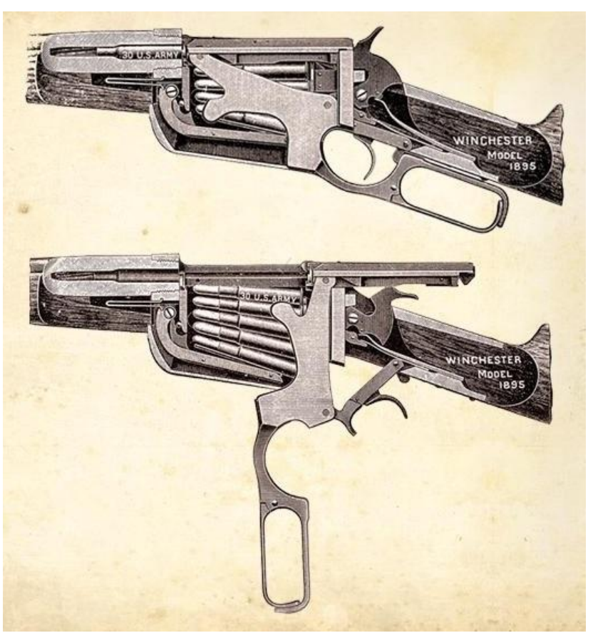
Fig. 6 – Cutaway drawing of action of Winchester Model 1895 from Winchester 1899 sales catalog. Public Domain.

Winchester produced some 425,881 Model 1895s between 1896 and the early 1930s (different sources list different dates for the end of production, citing between 1931 and 1936). The new model was offered in variety of calibers that were previously only available in Winchester single shot rifles, including the .30-40 Krag (.30 US or .30 Army), .38-72, and .40-72. In 1898 the .303 British was added to the lineup, followed by .35 Winchester (1903), .405 Winchester (1904), .30-03 (1905), .30-06 (1908) and finally 7.62mm x 54R (7.62mm Russian). As with most Winchester arms of the era, the guns were produced in a variety of models, including carbines (22" barrels), rifles (typically 24"-26" barrels) and muskets (military configuration with sling swivels, 28" barrels and bayonet lugs) and a couple of special "NRA" models with 24" and 30" barrels respectively. Blued barrels and receivers were standard.