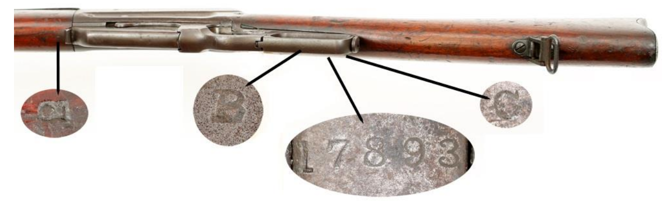
Fig. 15 – U.S. marked Winchester M-1895, S/N 17893, bottom view. Note the location of the sub-inspector stamps. The serial number is located on the lower tang underneath the closed lever.