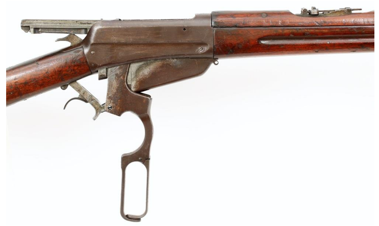
Fig. 4 – Close up of the open action with lever down of U.S. marked Winchester Model 1895, S/N 17893.

In order to keep the receiver from being too wide and ungainly, Browning used a single stack magazine design, rather than a staggered magazine. This meant that the magazine could only accept five rounds, while a staggered magazine design of the same depth would be able to accept 7 or 8 rounds. The box magazine increased the depth of the receiver, giving the Model 1895 its unique and instantly recognizable silhouette.