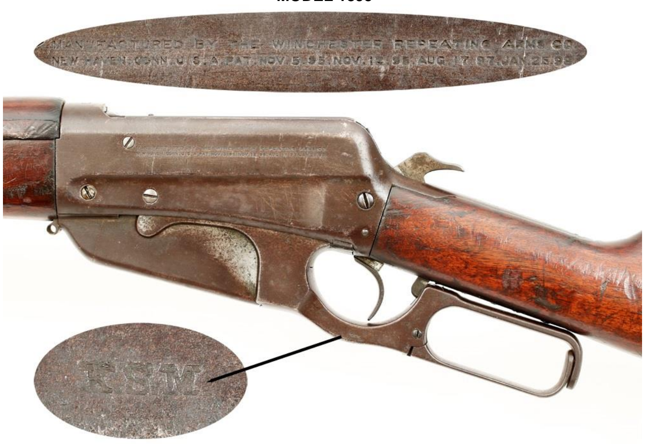
Fig. 12 – U.S. marked Winchester M-1895, S/N 17893, left side. Note the manufacturer's stamp on the receiver and the inspector's initials, KSM on the lever.