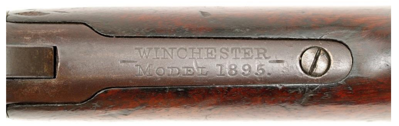
Fig. 14 – Upper tang with WINCHESTER / MODEL 1895.

Some examples of the U.S. Military Model 1895 Musket Rifle have been noted with Kelly S. Moore's initials (KSM) stamped on other parts of the rifle, such as the hammer or wrist of the stock. Moore also stamped a cartouche on the left side of the wrist of the stock. The cartouche consisted of his initials over the year 1898 inside a rectangle with rounded ends. The cartouche can be faint or no longer visible on well-used guns since many were carried by the wrist.