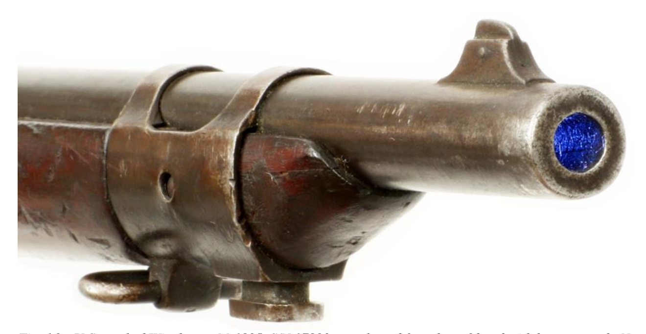
Fig. 16 – U.S. marked Winchester M-1895, S/N 17893, muzzle and front barrel band with bayonet stud. Note the ramp front sight with pinned blade.

The barrel remains almost entirely smooth and shows only some very lightly scattered pinpricking and some very light pitting around the face of the muzzle. There is also some wear to the finish and patina at the muzzle from the mounting and dismounting of a bayonet. The buttplate has a moderately oxidized dark gray patina over a mostly smooth, pewter gray base color and shows evenly distributed pinpricking and some scattered surface oxidation as well. The implement trap is in place in the buttplate. The 6-groove bore of the rifle is relatively dark, with light pitting along its entire length and with patches of moderate pitting.