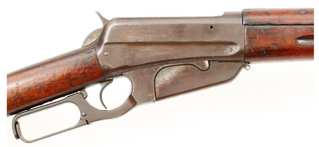
Fig. 2 – Close up of the right side of the action of U.S. marked Winchester Model 1895, S/N 17893. Photo Tim Prince, College Hill Arsenal.

The Model 1895 was the first Winchester rifle to feature a fixed box magazine located under the action instead of the tubular magazine design of previous Winchester lever action rifles. This allowed the rifle to safely chamber military and hunting cartridges with the new spitzer bullets. The M1895 was also the last of the lever-action rifles to be designed by John Browning, and featured a rear locking bolt as in his previous designs. The Model 1895 is the strongest lever-action rifle Winchester produced, designed to handle the increased pressures generated by the more powerful smokeless powder cartridges entering common use at the time of its introduction.