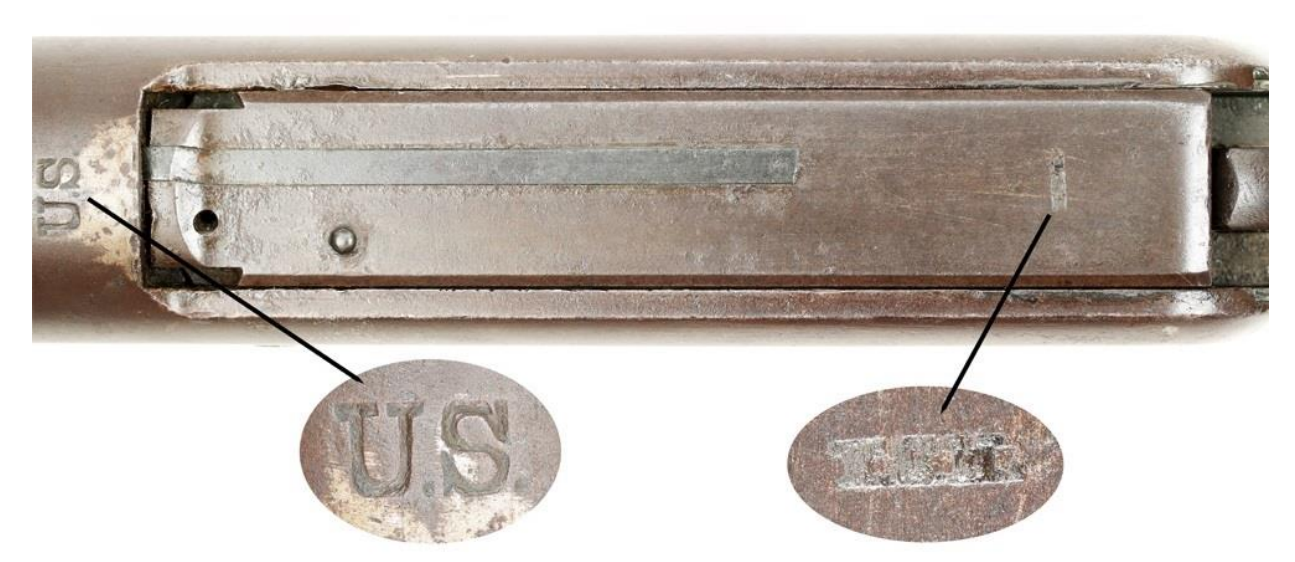
Fig. 13 – U.S. marked Winchester M-1895, S/N 17893. Note U.S. stamp on the receiver and the KSM inspector initials.