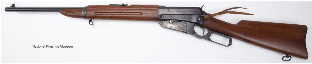
Fig. 18 – Winchester Model 1895 Saddle Ring Carbine. It is in Case 20 of the National Firearms Museum and was once the property of the Texas Rangers.