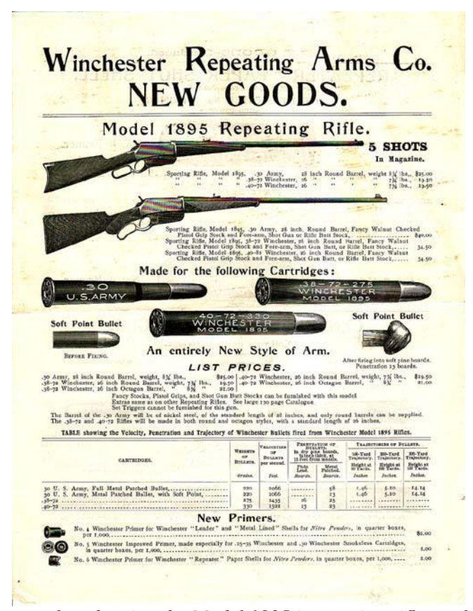
Fig. 18 – Early Winchester catalog showing the Model 1895 in sporting rifle configuration. Public Domain.

The U.S. Military Winchester Model 1895 is considered a desirable gun by American collectors of U.S. martial arms. Because most of the U.S. Military Winchester Model 1895 Rifles were sold to foreign countries, and saw years of combat, abuse and loss in Mexico during the 1910-1920 time period, they are relatively scarce in the United States. Many of them simply did not survive to make it back to their country of birth. Most of those that were reimported will show hard use and significant wear. For most US martial arms collectors this is a rifle that is very hard to find, and complete examples in any condition are prized acquisitions. These guns do not appear on the market very often and when they do they usually show the heavy use and abuse you would expect from a rifle that was likely carried by one or more Mexican revolutionaries for many years. The U.S. Army Winchester Model 1895 is one of the few cases where it appears nearly every example of this military arm was sold as surplus and then sold out of the country. That means that any U.S. military Winchester 1895 found today was probably reimported into the United States at some point in time, after doing duty in Cuba, Mexico or possibly a South American country.