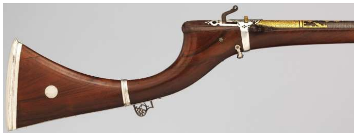
Matchlock rifle of Sarker Mir Muhammad Nasir Khan Talpur. Note the distinctive shape of the butt stock and the pierced steel trigger at the bottom of the butt stock.