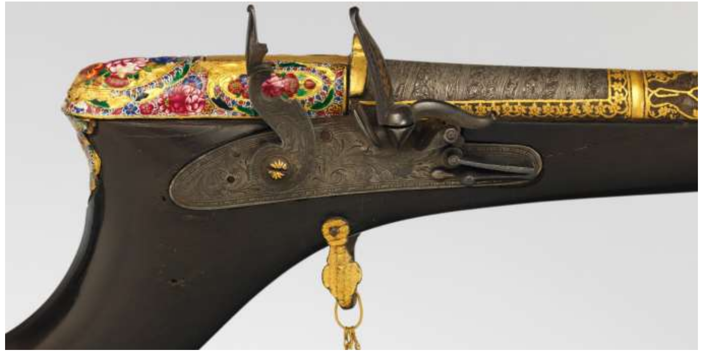
British lockplate of the Sindh flintlock rifle. Note the damascened gold design and opulent enamel decoration on the breech.

The stock of dark wood curves sharply downward before it flares out to a fishtail shaped butt. Unfortunately, the butt lost its separately applied upper butt end, the entire top section, and its mounts. The remaining mounts are of enameled gold. There is a large U-shaped mount surrounding the barrel tang at the top of the stock; a narrow band around the neck; a circular rosette set into the center of the butt on each side; and four barrel bands. The small, elliptical side plate, the trigger and trigger guard, and the sling swivel are all of gilded iron and the iron ramrod has a gilt fore-end. A gilt-iron prick to clean the vent and a small pad covered with woven fabric are attached to the rear sling swivel by a gold chain.