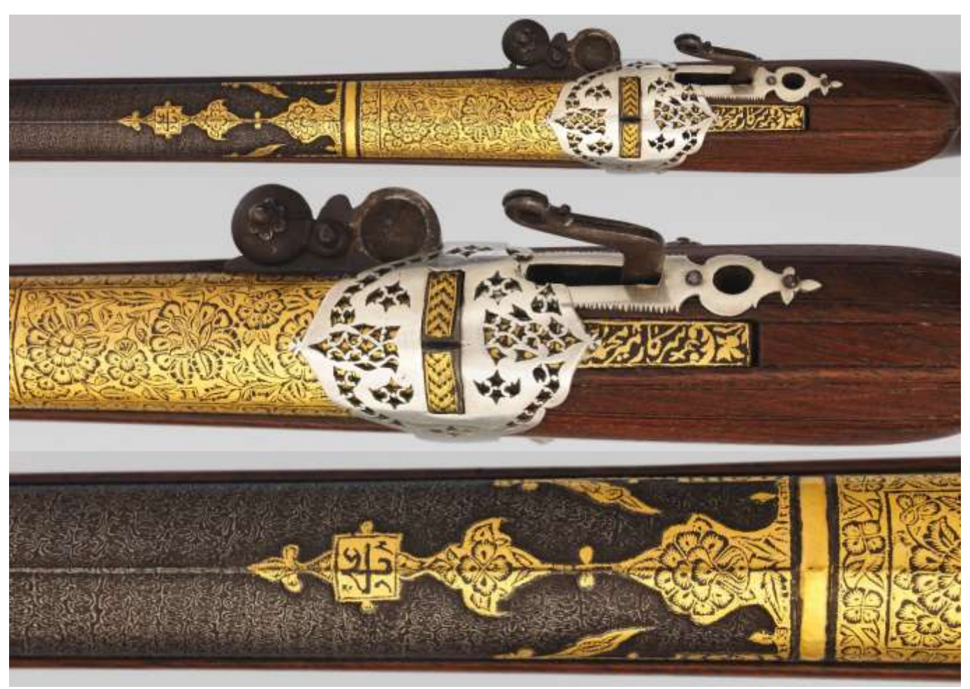
Matchlock rifle of Sarker Mir Muhammad Nasir Khan Talpur. Top Photo:Top of the breech section and barrel showing the matchlock serpentine and exquisite gold damascene decoration. With silver. Middlle photo: Close up of the gold and silver decoration. Note the notch rear sight and the matchlock pan and cover. Bottom photo: Close up of the decorated area. Note the beautiful pattern of the barrel's steel and the raised sighting rib.

The mounts are of silver and consist of a butt plate with simple raised moldings; a flat circular medallion set into the center of the butt on each side; a narrow molded band around the neck; a flat band along the underside of the butt, through which the steel trigger projects; the shaped surround for the match holder, a