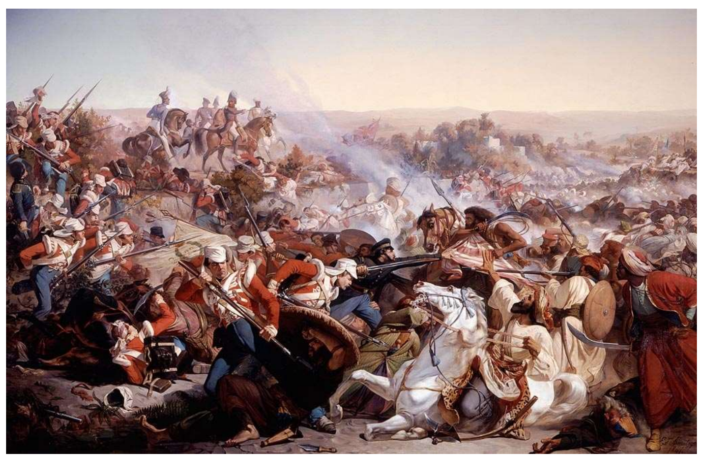
The Battle of Meeanee, 17 February 1843 . Painting by Edward Armitage, 1847. Note that only a few jezails are shown being used by the charging Sindhi army.

In 1843, after the British defeat and follow-up punitive expedition in Afghanistan, the East India Company decided that it wanted Sindh under direct Company control. The Baluchi Talpur Dynasty had ruled Sindh under the Afghan Durrani Empire from 1783 until Sir Charles Napier and his East India Company army defeated the Talpur Amirs at the Battles of Meeanee (Miani) and Dubbo (Hyderabad) and conquered Sindh in 1843. It should be noted that although the Sindhi were heavily influenced by the Afghans, even to the forms of their weapons, because the Sindh terrain was mostly flat in the east and central regions, the Baluch Sindhi armies fought differently than their Afghan cousins. Instead of marksmen shooting their long jezails from mountain tops, the Baluch Talpurs relied on massed charges by part-time undisciplined cavalry and infantry levies armed mostly with sword and spear, such as during the Battle of Meeanee. This was less than effective against massed volley fire followed by bayonet charges by trained and disciplined British and East Indian Company Sepoy troops.