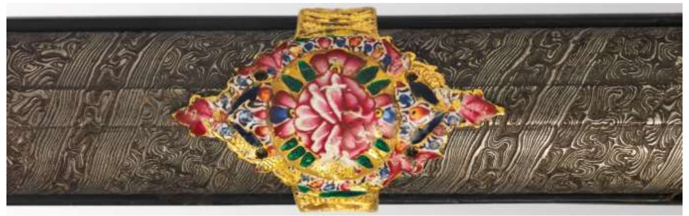
Sindh flintlock rifle with HM stamped lockplate. Gold barrel band with painted enamel floral decoration combining both Moghul and Persian flower designs. Also note the spiral twist etching design on the pattern welded steel barrel.

The enamels on this rifle draw on both Mughal and Iranian designs. The thin willowy green leaves that are part of the decoration of this gun are characteristic of Mughal motifs while Iranian enamelwork is distinguished by designs incorporating large flower heads, often closely packed together in a lush brocade, such as also found on this gun. Thomas Postans reported that the Amirs of Sindh employed one or two Persian goldsmiths at the Talpur court who "are engaged at court in enameling and damascening, in which arts they have attained great perfection." According to the Metropolitan Museum of Art, it is possible that they or their students were responsible for many of the enameled mounts on this rifle.