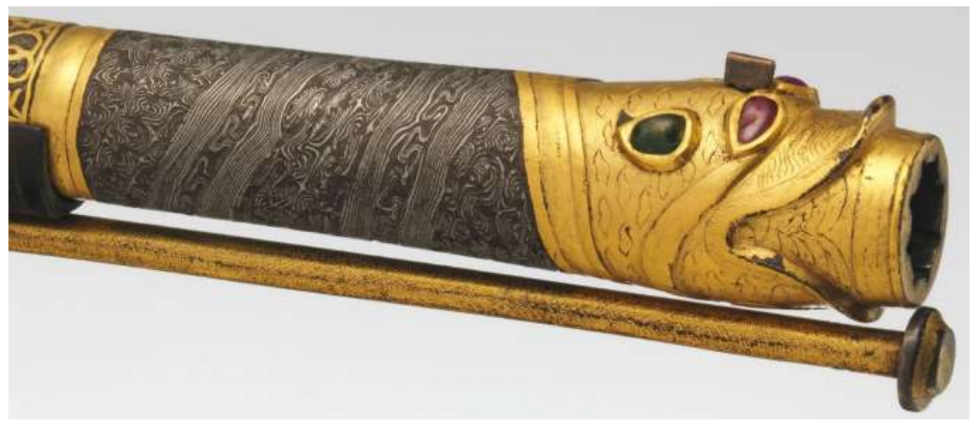
Gilt stylized tiger head muzzle of the flintlock Sindh rifle with HM stamped lockplate. Note the spiral twist etching design on the pattern welded steel barrel and the gilded end of the ramrod.