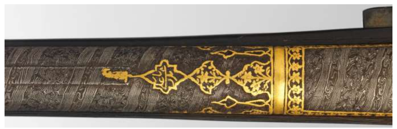
Sindh flintlock rifle with HM stamped lockplate. Top of the barrel. Note the gold decoration and the spiral twist etching design on the pattern welded steel barrel. Also note the wide flat sighting ridge.

The enamels on this rifle draw on both Mughal and Iranian designs. The thin willowy green leaves that are part of the decoration of this gun are characteristic of Mughal motifs while Iranian enamelwork is distinguished by designs incorporating large flower heads, often closely packed together in a lush brocade, such as also found on this gun. Thomas Postans reported that the Amirs of Sindh employed one or two Persian goldsmiths at the Talpur court who "are engaged at court in enameling and damascening, in which arts they have attained great perfection." According to the Metropolitan Museum of Art, it is possible that they or their students were responsible for many of the enameled mounts on this rifle.