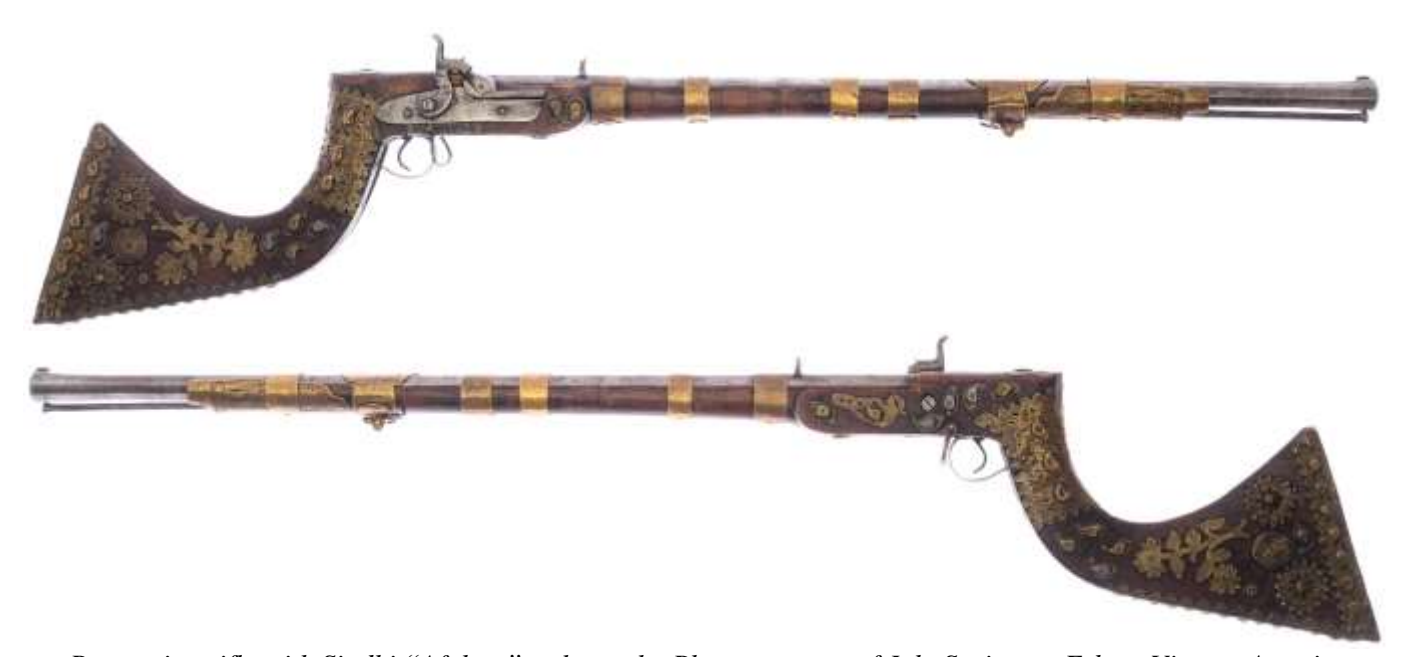
Percussion rifle with Sindhi "Afghan" style stock.