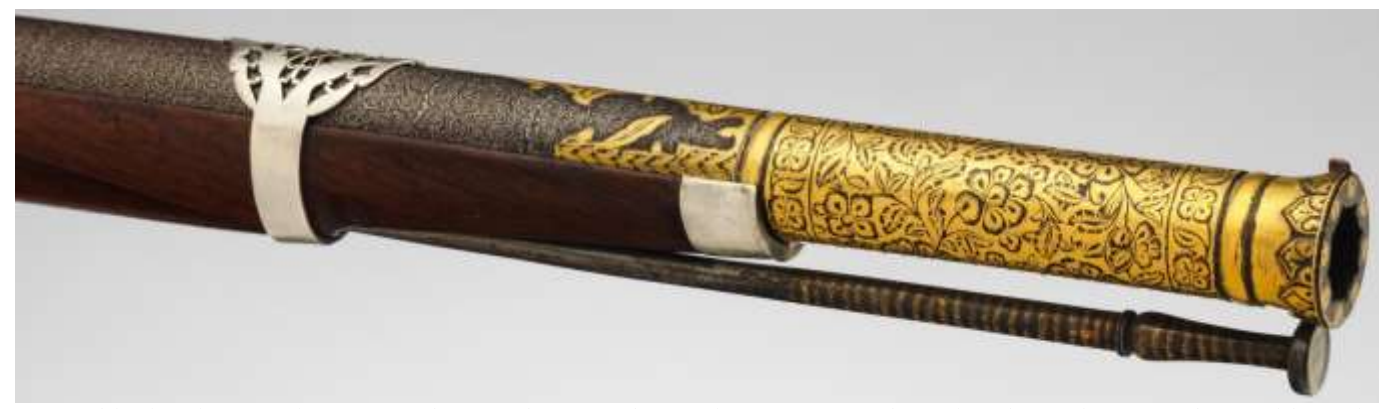
Matchlock rifle of Sarker Mir Muhammad Nasir Khan Talpur. Front of barrel and muzzle. Note the steel barrel pattern, the raised sighting rib, the silver foreend cap and barrel band and the gold damascened floral decoration on the barrel and muzzle. Also note that the shaped iron ramrod has what can be called tiger stripped coloring.

cap at the end of the forestock, and five barrel bands pierced with foliate scrolls. The rearmost band fits over the rear sight, the second from the muzzle has a sling swivel; and there is a rear sling swivel attached through the stock in front of the trigger. The gun has an iron ramrod with a shaped and flattened tip and the fore-end is damascened with gold.