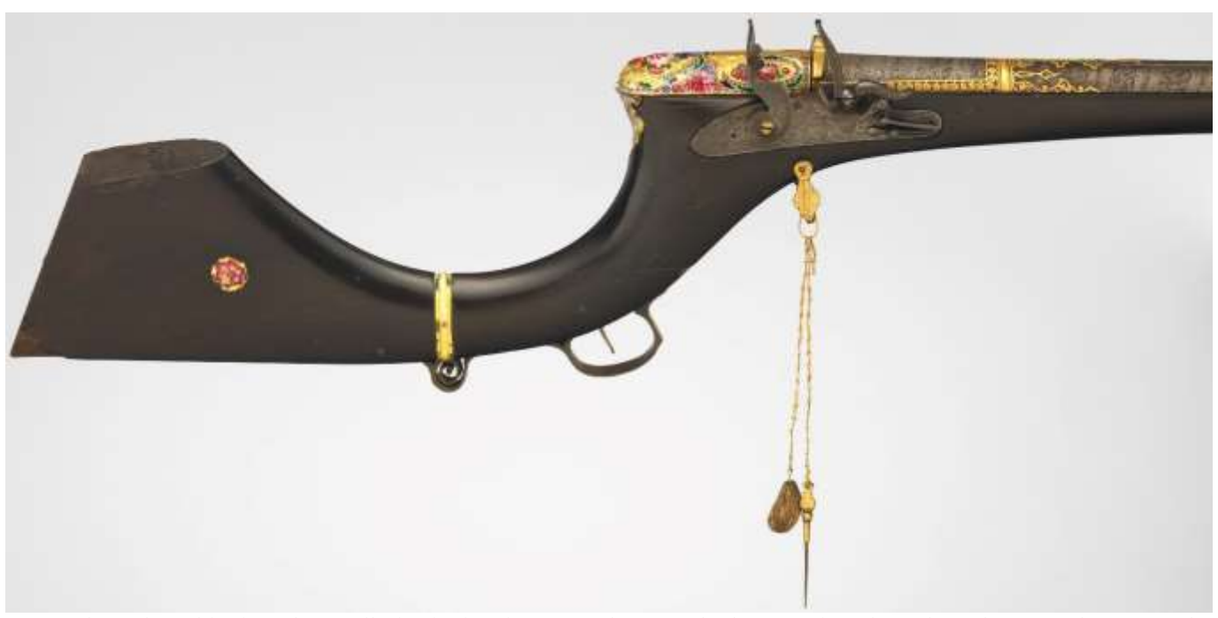
Butt, breech and lock of the Sindh flintlock rifle. Note shape of the butt stock with its deep downward curve and broad butt. Note also the gold enameled medallion in the butt, the gold mounts and gold damascene on the breech and barrel.

The flat English flintlock has a friction-reducing roller between the frizzen and its spring. The surfaces are blued and engraved with foliate scrolls within a notched border. The upper part of the cock, including the jaws, has broken off. The outer face of the frizzen is inlaid with gold leaves, the pan retains traces of its former gold surface, and the screw head for the cock pivot is also gilt with leaves. Inside the lock plate are the stamped initials " H. M. " One can conjecture that these initials are possibly those of well-known London gunmaker, Harvey Walklate Mortimer (1753–1817).