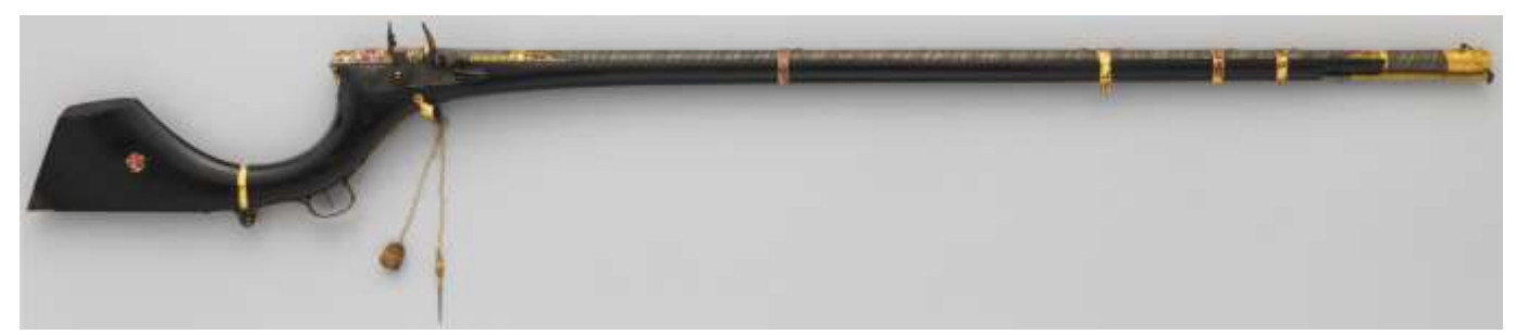
Flintlock rifle with HM stamped lockplate.

The second gun from Sindh, also in the Metropolitan Museum of Art's collection, is a flintlock rifle and is typical of Sindh with its with sharply curved flaring butt and mounts in enameled gold of Iranian manufacture. It is also from the Talpur royal armories. It has a British made lock which is marked " H.M. " on the inside. The richly decorated rifle is 58 7/8 inches long with a .56 caliber 42 ¾ inch long barrel, and weighs 9 pounds 11 ounces. It dates from the second quarter of the 19<sup>th</sup> century.